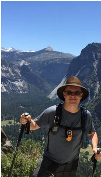
Yosemite April 2015

I grew up with a condition that caused my bones to grow close to the joints, causing intense pain in even the slightest movement. So as a child, I had 15 operations that produced 25 scars. Growing up, I tried to be active in several sports. Because of the pain, I was told to stop. Through most of my adult life, I used that as a crutch, and the weight came with it. Fitness for most of us is not easy. We deal with the decision to do it or not every day. After all, it is a choice. A few years ago, I finally found my exercise passion—