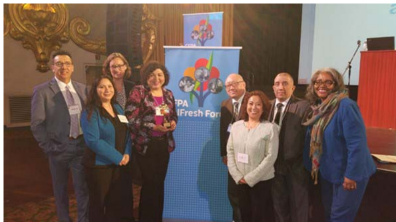
Members of the DPSS team representing the outreach efforts of CalFresh Program celebrate winning the California Food Policy Advocates “Freshy” Award, recognized for the department’s innovative social media campaign to reduce hunger in L.A. County.

This year marks the ninth year of CalFresh Awareness Month in the County. Throughout the month of May, DPSS will partner with County departments, the 88 cities in the County, community and faith-based organizations, community health clinics, food insecurity coalitions, supermarket chains, farmers’ markets, food banks, college campuses, school districts, and homeless services organizations to achieve the goals of the campaign. Additionally, the inclusion of the #ChooseCalFresh campaign has enhanced the existing outreach by seizing on the power of social media to better inform and serve residents more efficiently.