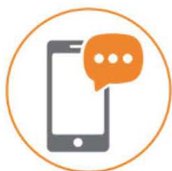
Phone and Text-based phishing

STOP, LOOK, and THINK before complying with requests from strangers who prey on your social nature. It is better to be firm than insecure.