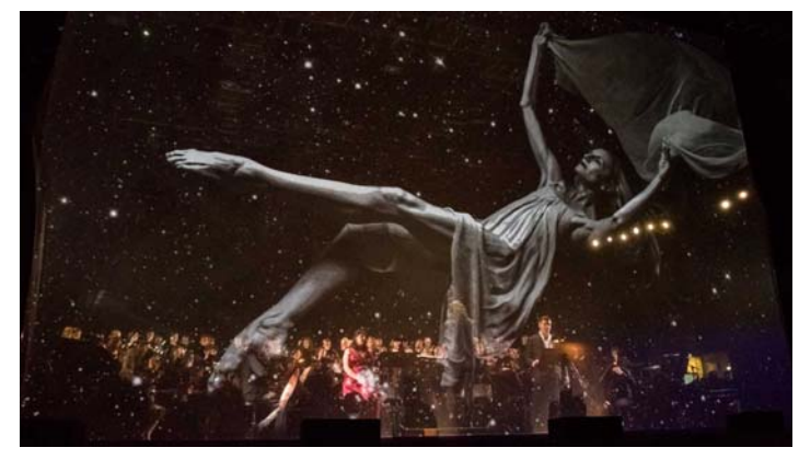
The Hubble Cantata on October 11.