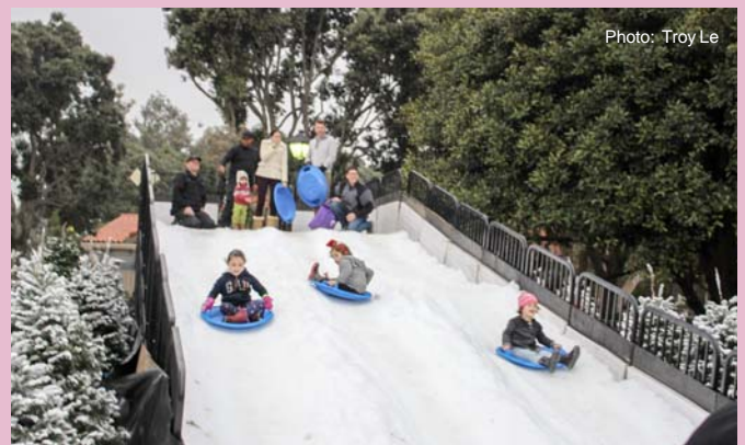
Kids race down the sledding hill during the Snow Wonder festival.