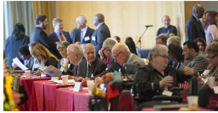
Commissioners, Department Heads, and other County officials attend the annual Leadership Conference.